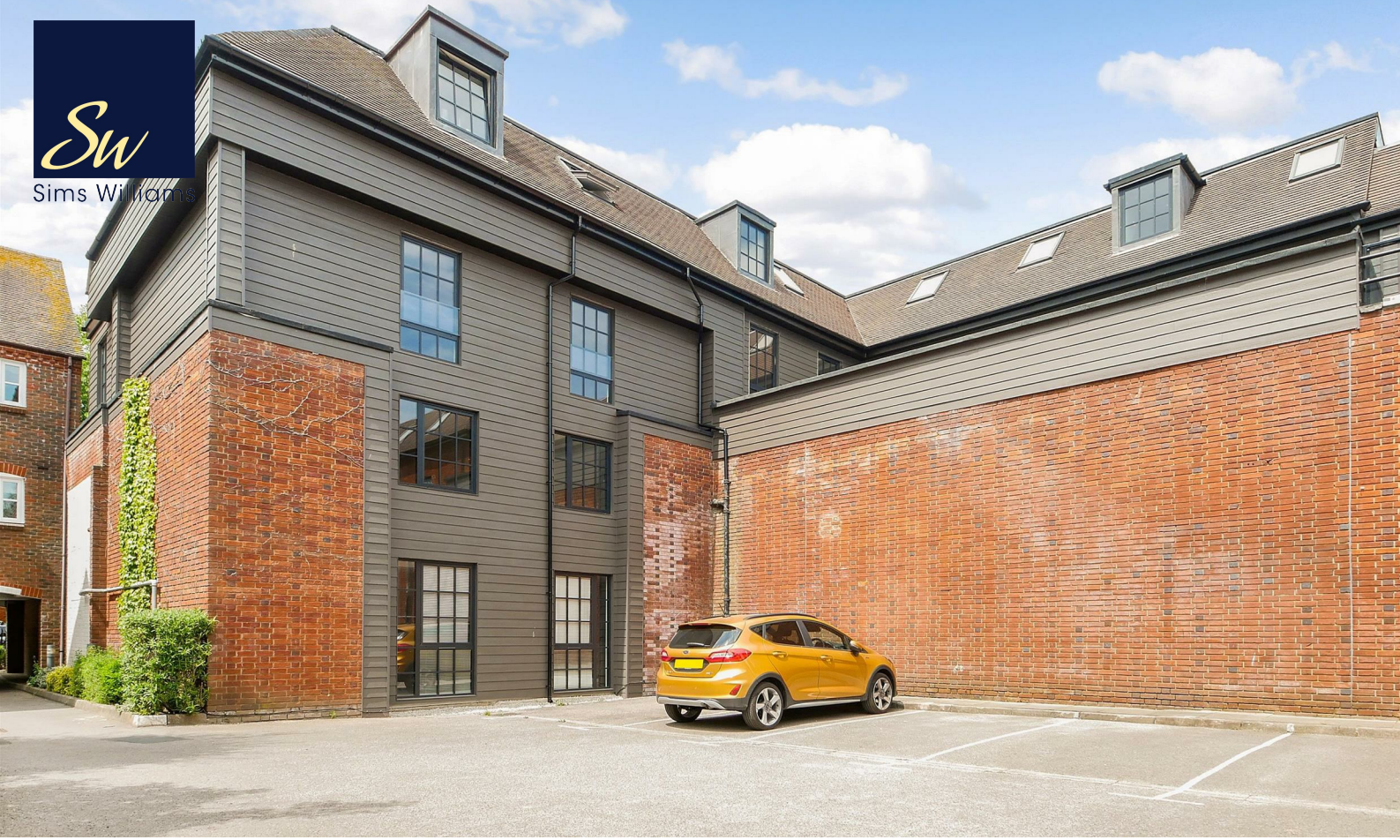
FLAT 1 MONTCLAIR HOUSE, 19 SOUTHGATE, CHICHESTER, WEST SUSSEX, PO19 1DN